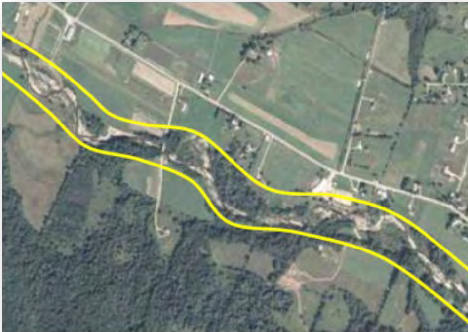
Figure 2: Meander Belt

While this represents a state of equilibrium, the river corridor remains dynamic and continues to evolve and will exhibit changes in channel alignment over time, particularly a lateral and downstream migration of the channel. While the channel may change location, it is stable in pattern, profile, and dimension because there is a balance in processes. For instance, bed erosion in a certain part of the channel is counteracted by depositional processes elsewhere under stable flow and sediment transport regimes such that channel dimensions, pattern, and profile will not change and access to the floodplain will be maintained. The continued movement of the channel also introduces the concept of the meander belt. The meander belt is the corridor in which the channel will naturally migrate back and forth over time to accommodate equilibrium conditions (Figure 2). The meander belt width is dependent upon various watershed features and stream type, but valley walls are primarily responsible for confinement. Man-made confinements like levees, elevated roadways and bridges, bank armoring, and other structures and developments in the meander belt can limit the natural channel migration processes and cause disequilibrium in the system.